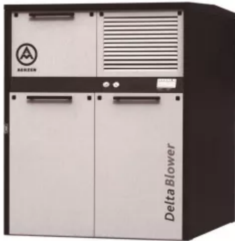
Fig. 3: Thanks to the housing of the Aerzener blower, the noise level is reduced by an average of approx. 6 up to 8 dB(A).

Furthermore the conversion of the new solution in Hanover was subjected to a very narrow time frame so that additional observations for a change-over from negative pressure to positive pressure transport could not be carried out.