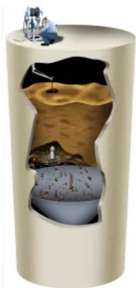
Fig. 1: The modular boom of the Martin Heavy Duty Whip extends up to 8.5 m (28 ft) and can clean vessels up to 18 m (60 ft) in diameter from a central opening of just 450 mm (18 in).

When the Eagle Materials Illinois Cement facility experienced a serious blockage in its 80000 ton storage silo, the company employed an innovative pneumatic cleaning technology that was remote controlled from outside the domed structure.