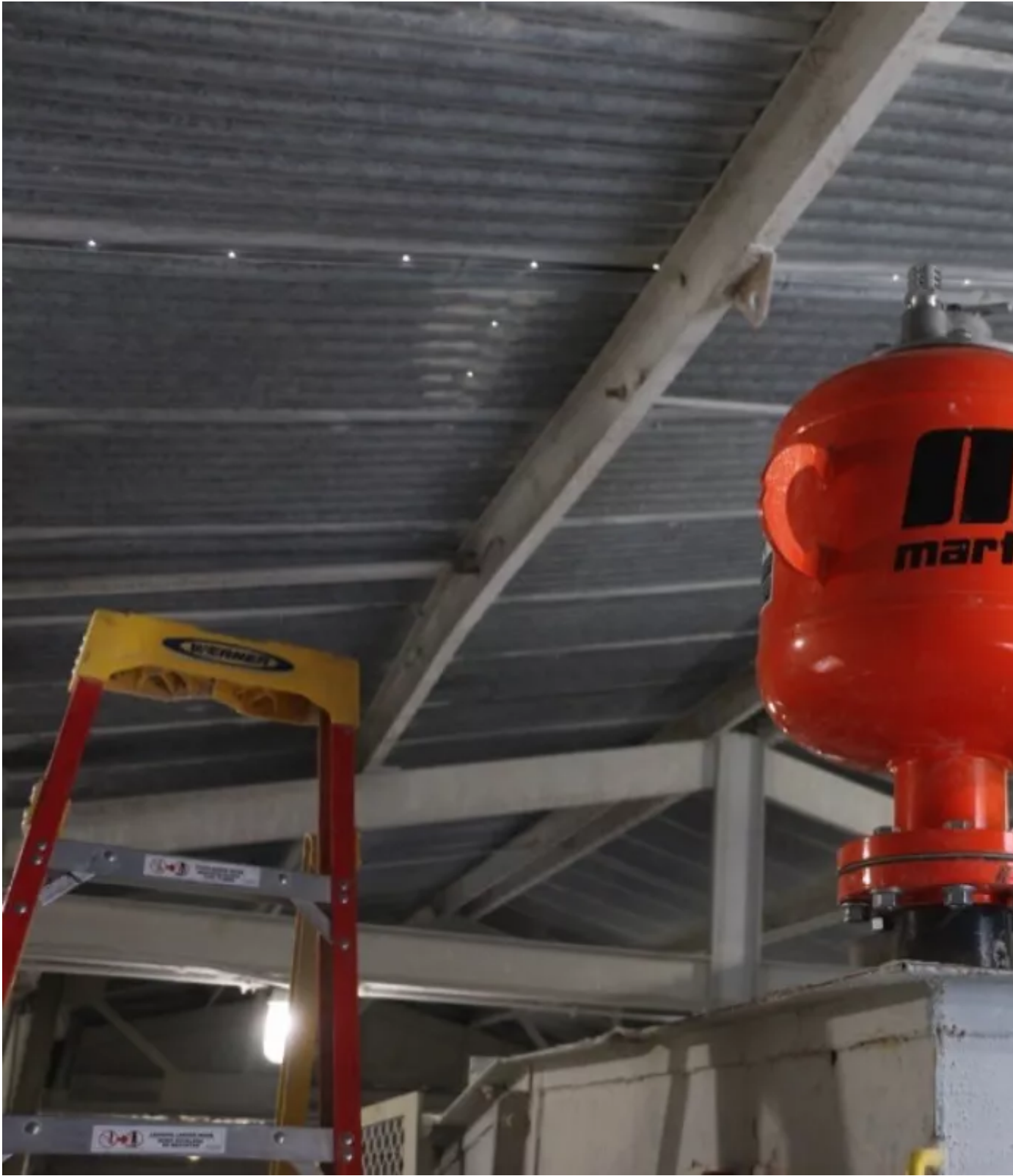
One cannon was located at the head of the conveyor.