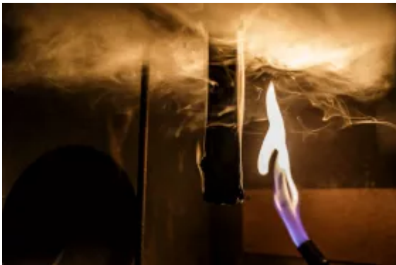
ISO 340 fire resistance testing

The basis of most tests for belting used in normal industrial applications is EN/ISO 340. This standard makes the distinction between fire resistance with covers (K) and fire resistance with or without covers (S). The relevance of “with or without covers” is that wear reduces the amount of fire resistant rubber that protects the flammable carcass. Although no longer used in the current EN ISO 340, the market still commonly refers to grades ‘K’ for testing with covers and ‘S’ for testing with and without covers. This originates from DIN 22103 that was used as the basis during the creation of EN ISO 340.