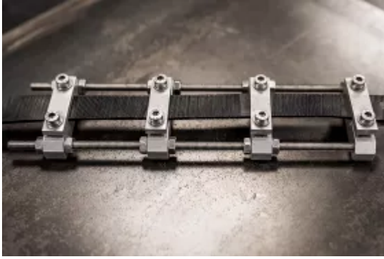
Ground level ozone seriously damages rubber

Although not an actual cover grade in its own right, there is no question that ALL rubber conveyor belts need to be fully resistant to the damaging effects of ozone and ultra violet light. This is because at ground level ozone becomes a pollutant. Exposure increases the acidity of carbon black surfaces and causes reactions to take place within the molecular structure of the rubber. This has several consequences such as a surface cracking and a marked decrease in the tensile strength of the rubber. Likewise, ultraviolet light from sunlight and fluorescent lighting also accelerates deterioration because it produces photochemical reactions that promote the oxidation of the surface of the rubber resulting in a loss in mechanical strength.