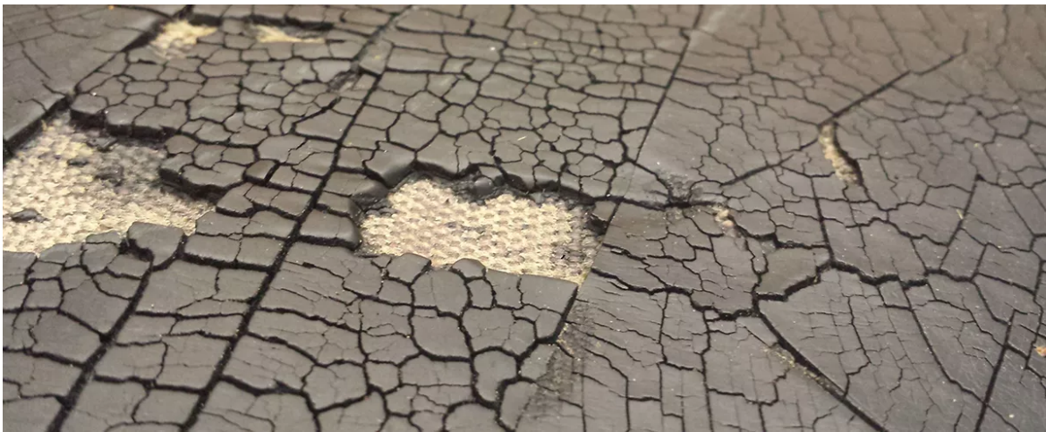
The effects of heat damage

Of all the demands placed on industrial conveyor belts, heat is widely regarded as the most unforgiving and damaging. High temperature materials and working environments cause an acceleration of the ageing process that results in a hardening and cracking of the rubber covers.