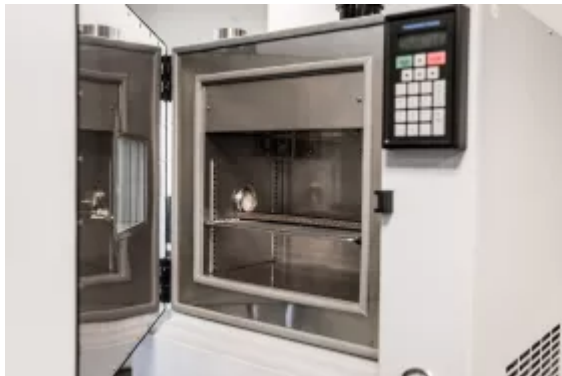
Belt samples are frozen using liquid nitrogen

There are no current internationally recognised test methods for specifically determining a conveyor belt's ability to function in extremely cold conditions. Laboratory testing involves the use of a liquid nitrogen freezing cabinet to test samples at extreme low temperatures.