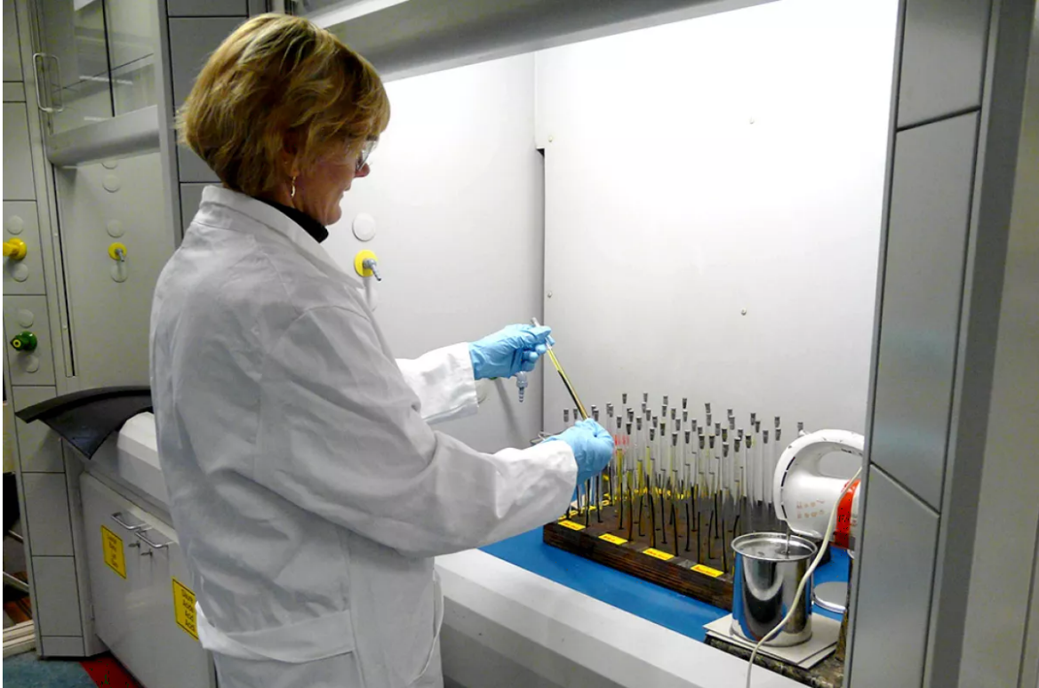
ASTM 'D' 1460 Testing

and the temperature at which the liquid and sample are kept can be varied but the most common is either 3 or 7 days at ambient or 70°C.