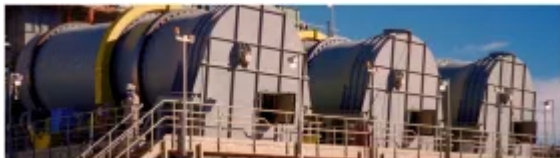
Heyl & Patterson Rotary Dryer

The airflow in direct heat rotary dryers can be either counter or parallel to the conveyance of the material inside the dryer. Parallel flow dryers expose the wet feed material to the hottest air temperature. They are very efficient for handling high moisture content sludge and filter cakes. Because of the rapid heat exchange, there is significant evaporative cooling of the product. This cooling effect allows for drying a wide range of materials with varying heat sensitivities without thermally degrading the materials.